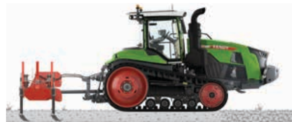
Figure 1: A tractor goes to work without proper tractor and implement weight distribution. This results in insufficient front weight on the tractor, and as a result increases slip.

When equipped with Smart Ride Plus suspension, the 1100 Vario MT features a load-leveling suspension system. With the push of a button in the cab, Smart Ride Plus uses hydraulic pressure in the track suspension elements to raise or lower the front of the machine. This results in better weight distribution for better traction, ride, and overall performance.