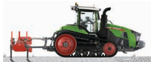
Figure 2: The 1100 Vario MT with Smart Ride Plus allows for easy adjustment of the weight distribution. This results in reduced slip, improved ride comfort, and improved overall performance.